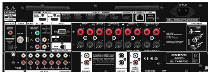
Text on receiver may vary with region.