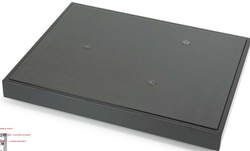
Ground it Carbon magnetic decoupling feet