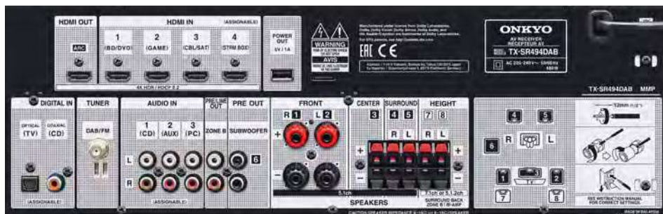
Text on receiver may vary with region.

AccuEQ Room Acoustic Calibration creates a harmonious soundfield in your room. It detects speaker presence, size, and