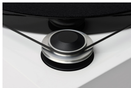
Diamond-cut aluminum drive pulley: precise power transmission