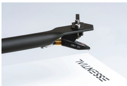
One piece 8.6" aluminum tonearm Cartridge: Ortofon OM10

The top grade OM10 pickup by pioneer Ortofon will guarantee for sonic pleasures all around. Essential III SB delivers lively, balanced and highly involving sound that will delight every vinyl lover. Essential III SB comes in the aesthetic high-gloss colors black, red and white.