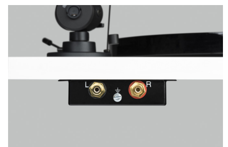
High quality gold-plated RCA sockets