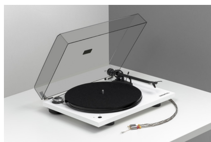
Dust cover, felt mat and high quality connection cable Connect-it E included