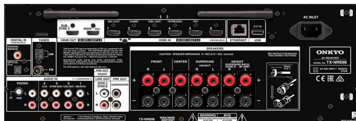
Text on receiver may vary with region.